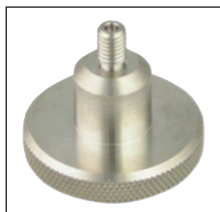
Figure 3. Image of SilTite™ FingerTite Install tool.